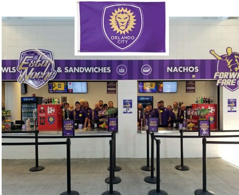
Masons in a Frame!!!