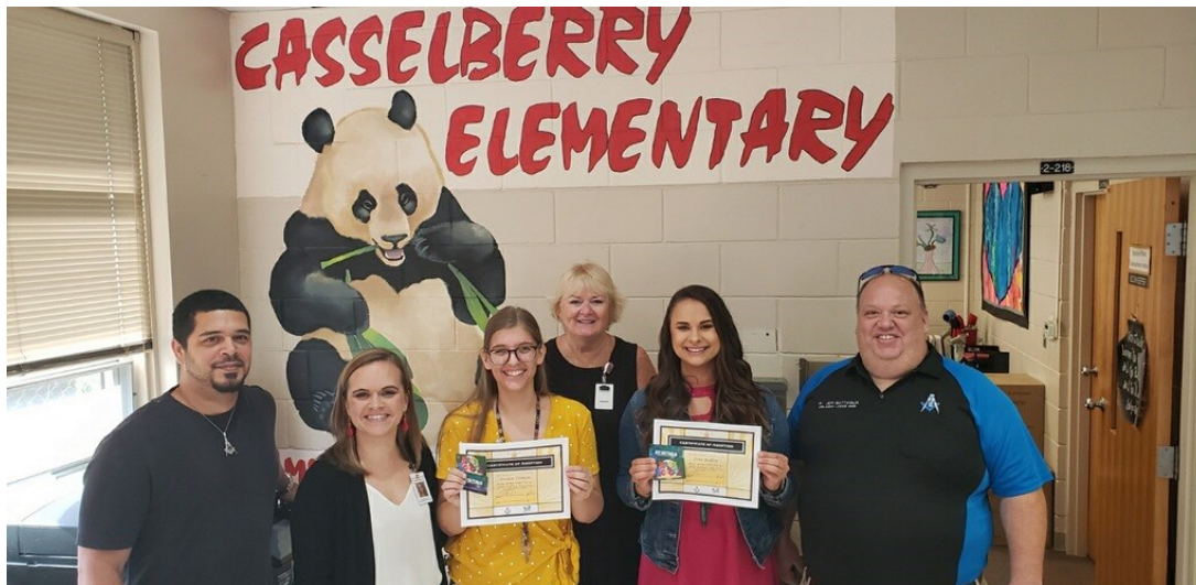
Casselberry Teachers say, "Thank You!"

Do you have pictures you'd like to share?