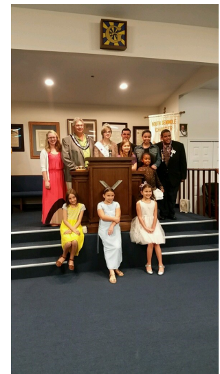
Family, Youth and Widows Night Dinner