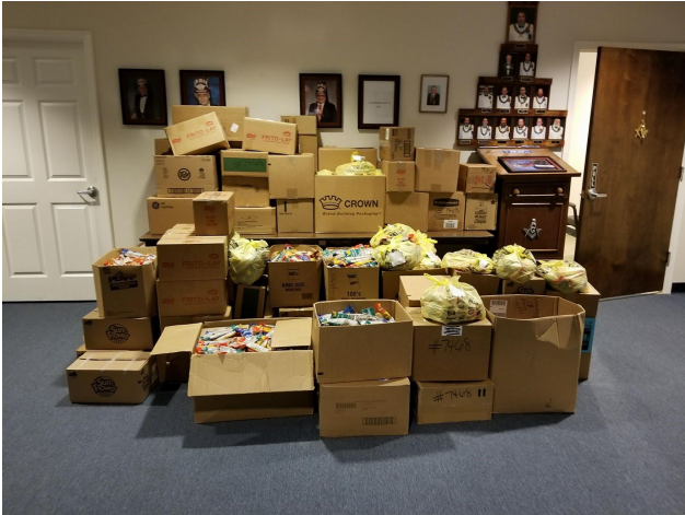
Peanuts and Sunflower Seeds For Soldiers