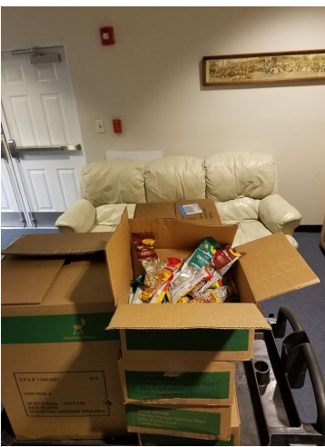
Orlando City Soccer